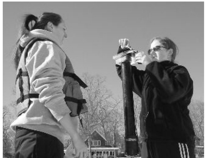
Figure 3. Students sampling an ~50 cm-long core that contains the sediment-water interface.

The second field lab also covers two weeks (Weeks 4-5), and is designed to document the spatial variation of physical properties of lake sediments. Students and