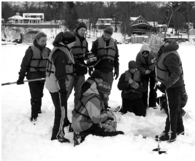
Figure 2. Students with personal flotation devices on Ballston Lake, NY.

Field Activities - Field activities are aimed at providing students with the opportunity to use a variety of instruments (Table 3) for the direct measurement of water properties or the acquisition of samples of lake water and sediment. Safety, of course, is our first priority and we follow basic recommendations for safe travel on frozen lakes ( http://www.crrel.usace.army.mil/ierd/ice_safety/safety.html ). All students and faculty wear personal flotation devices (Figure 2) and carry small hand ice picks, which are designed to help one pull oneself out of lake water and onto the floating ice surface should one break through. In addition, we always bring at least one ~25-meter-long 11 mm-thick rope. Exposure to sub-freezing air temperatures for several hours is also a concern. The Geology Department supplies all participants with pack boots that are rated to -25°F, and students are strongly encouraged to dress for the elements.