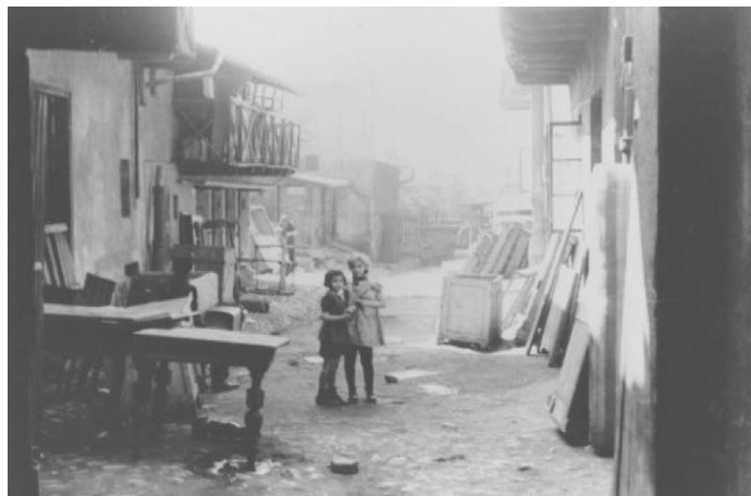
Kamionka: Jewish ghetto in Bedzin