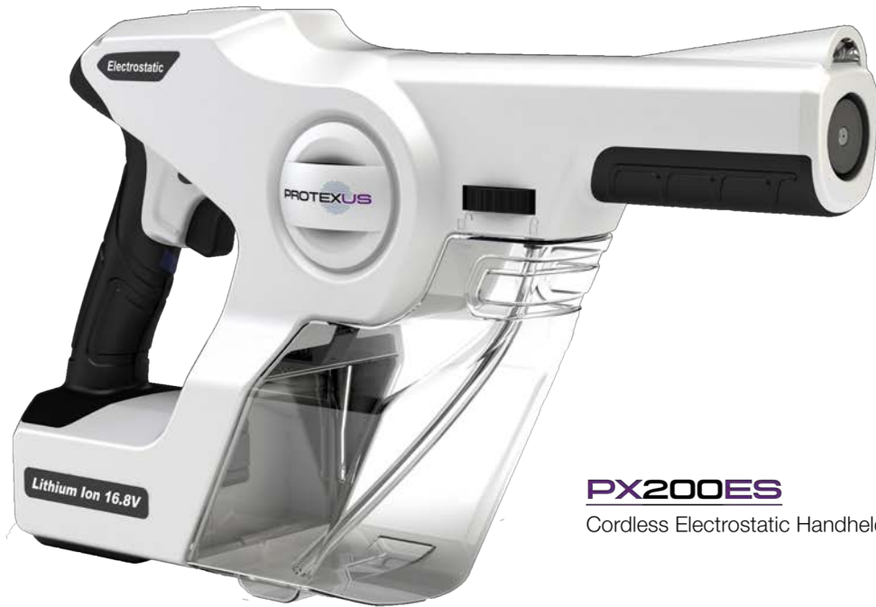
PX200ES Cordless Electrostatic Handheld Sprayer