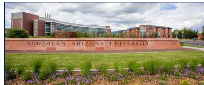
Applied Research and Development