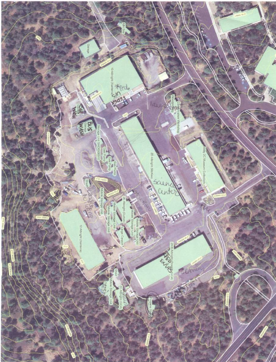
Figure 1 Aerial photo of the site. Scale = 1: 1 464/ 1"=122'. The disturbed area is 431,000 square feet.