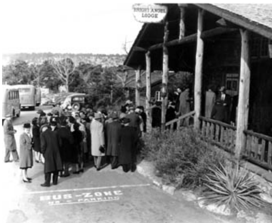
Bright Angel Lodge, Grand Canyon National Park.