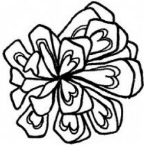
pinyon pine cone