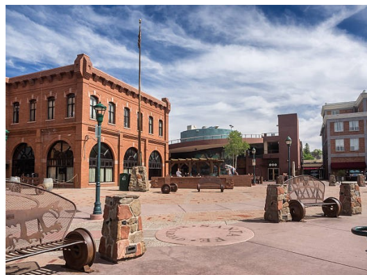
Heritage Square, Flagstaff