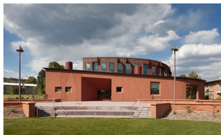
Native American Cultural Center